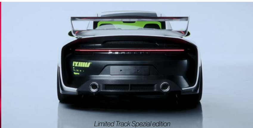
Limited Track Spezial edition

The rear view of the Turbo Spezial is a sight to behold, a mesmerizing spectacle that leaves onlookers in awe. As it disappears into the distance, all that remains is a black void, seemingly absorbing time and space itself.